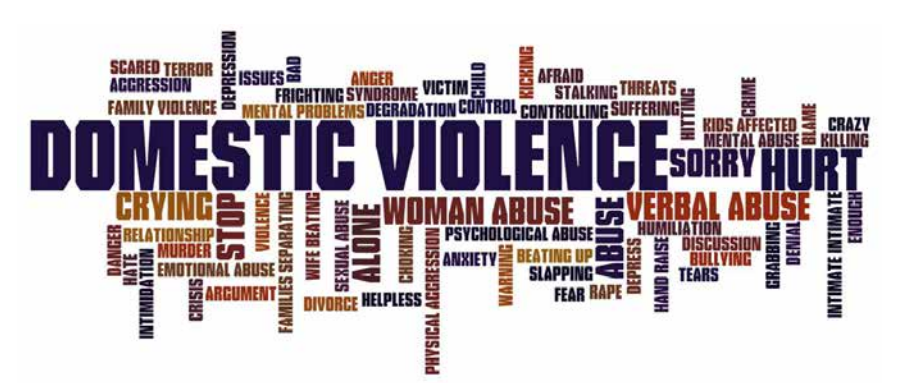
Page 15 Auburn Police Department Annual Report to the Community 2014

event, follow up with the children to ensure their safety and make school officials aware of why a child might be "acting out of character."