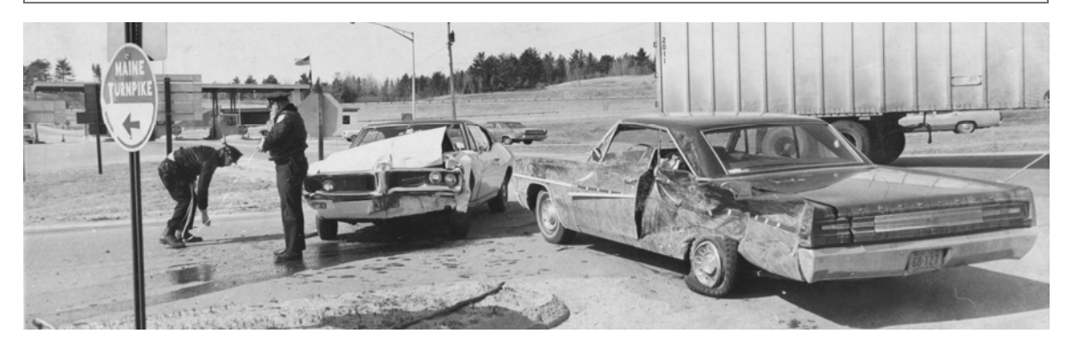
Page 19 Auburn Police Department Annual Report to the Community 2014

The Maine Department of Transportation reported a 5 year average of 1,051 reportable crashes in Auburn per year. Other cities in Maine with comparable numbers: Augusta - 925; Bangor - 1,338; Lewiston - 1,054; State Police, Skowhegan - 1,027; State Police, Troop E - 981; and South Portland Police Department - 894. Portland had the highest 5 year average, with an average of 2,565 reportable crashes per year.