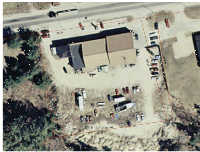
Figure 1: 2001 Aerial Figure 2: 1998 Aerial