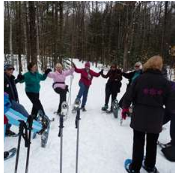
Figure 1.9 Winter fun at Mount apatite Trails

collaborate with MEARNG to assure a long term compatible relationship between the two adjacent facilities.