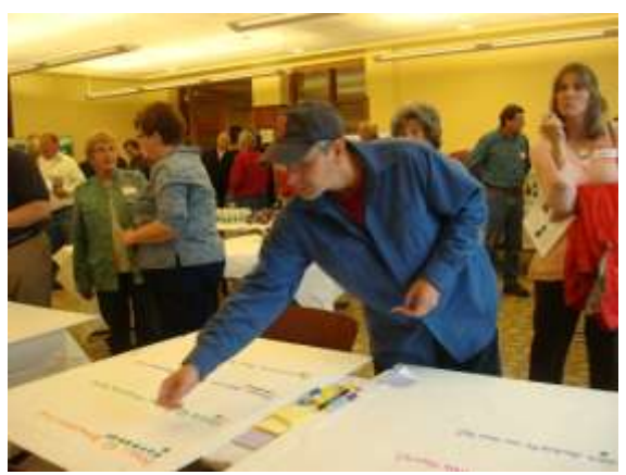
Figure 2.2 Community members at Open House

Of those, most left comments with consultant team or on map displays and flip charts. Some highlights of the feedback include: mixed feelings about obtaining or relocating ballfields; and if the ballfields are transferred to the City, most of those who left comments were torn about the need to transfer land from the Park to the training site. A summary of the feedback is included in the Appendix.