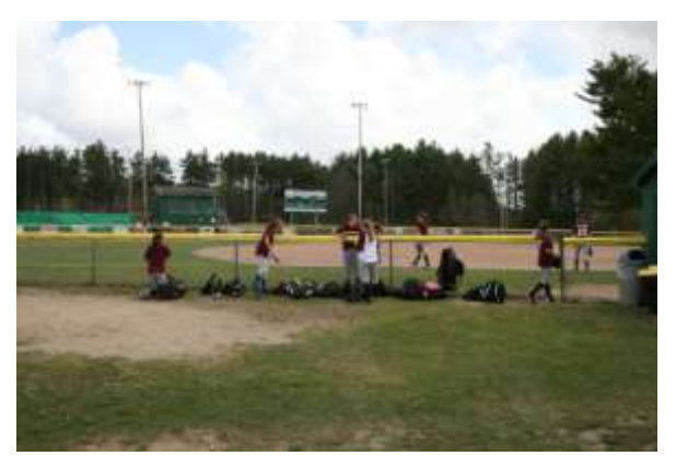
Figure 1.6 Sports team ready for play

that over 26.9 million children participated in baseball and 10.8 million participated in softball.<sup>3</sup>