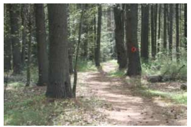
Figure 1.8 Unauthorized Trail through Land Navigation Area at Auburn training site

In 2012, the Trust for Public Lands (TPL) released an economic impact assessment of Maine's Land for Maine's Future program.<sup>9</sup> It concluded that snowmobiling supports 3,600 jobs and generates $273 million in snowmobile-related expenditures and over $400 million in total economic impact in Maine. These figures are somewhat different