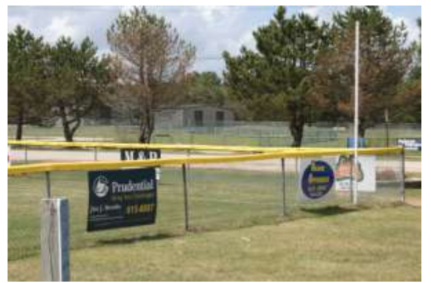
Figure 1.2 Auburn Suburban Little League Field with controlled humidity preservation building in background

In addition to the land area deficit, roughly 28 acres of installation land are currently in recreational use as ballfields and associated parking. See Figure 1.2. The Auburn Suburban Little League ballfields and parking area were built for the City by the Army National Guard in the late 1980s on installation land. In exchange for this, the City