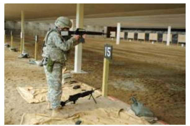
Figure 1.4 MEARNG Baffled Range

and MEARNG are intent on minimizing the conflicts inherent in this and other training activities.