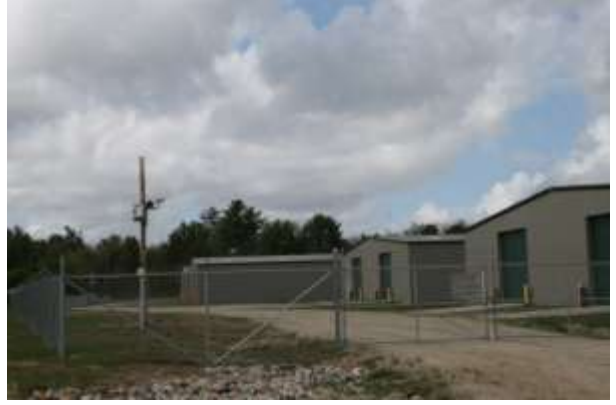
Figure 1.5 Controlled humidity preservation buildings

attributed to personnel, it is estimated that just over $3M (or 7.4%) can be attributed to the Auburn facility and includes drill pay for training, active Army National Guard Reserve pay and other programs. In terms of Auburn Facility operations and maintenance, it is estimated that almost $4.9M (or 4.3% of statewide total) is generated in civilian pay and facility upkeep. There were no construction dollars spend in Auburn in FY 2012; the last military construction project executed at the Auburn training site was in FY 2008 in the amount of $6.8M. In the future, the MEARNG intends to upgrade its Auburn firing range at an estimated cost of $1.5M.