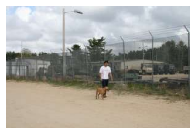
Figure 1.3 Recreator passing through training area

Further exacerbating the risk, park and training land boundaries are not well marked. Users of Mount Apatite Park have a history of utilizing land surrounding and within the training site which has limited the training utility of the site as unsuspecting recreators