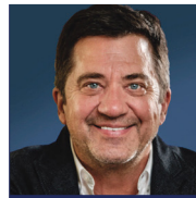
Dr. Henry Cloud