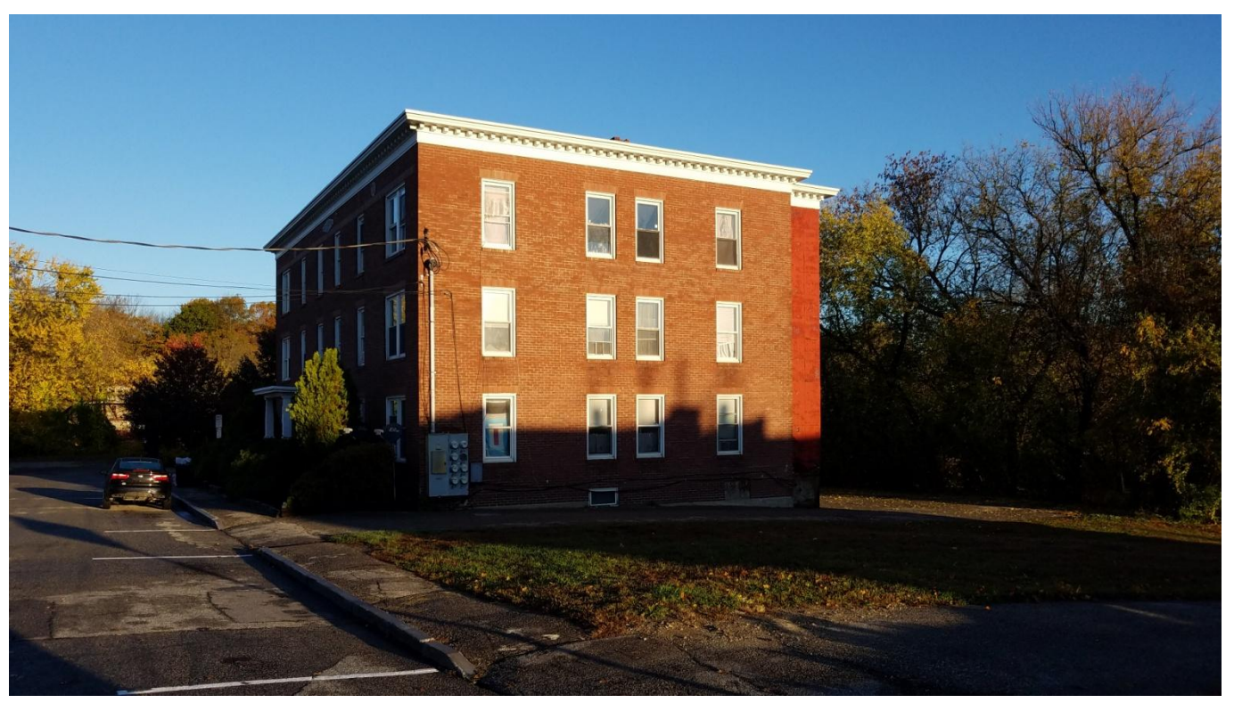
10 Second St. (looking north)