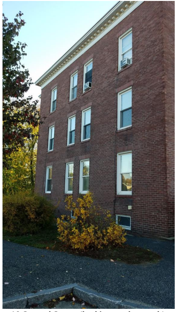
10 Second Street (looking to the south)