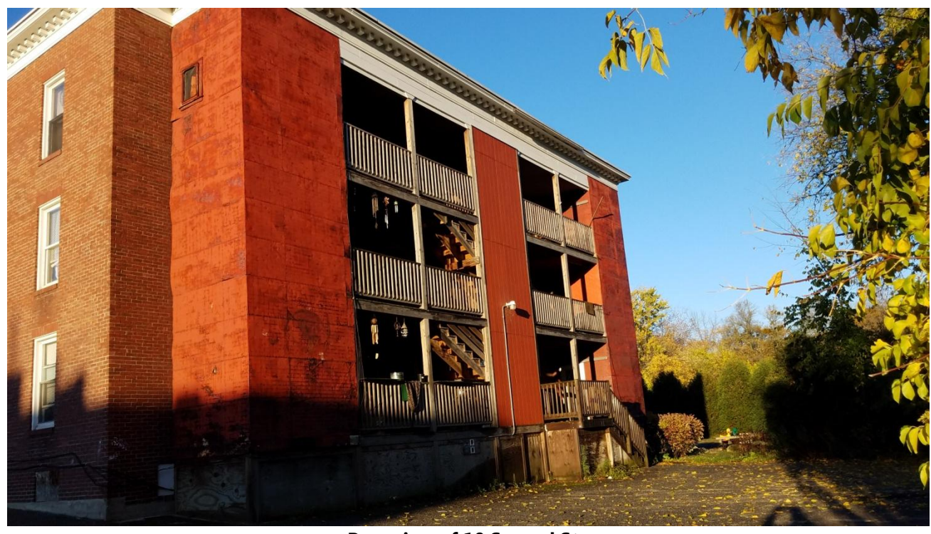
Rear view of 10 Second St.