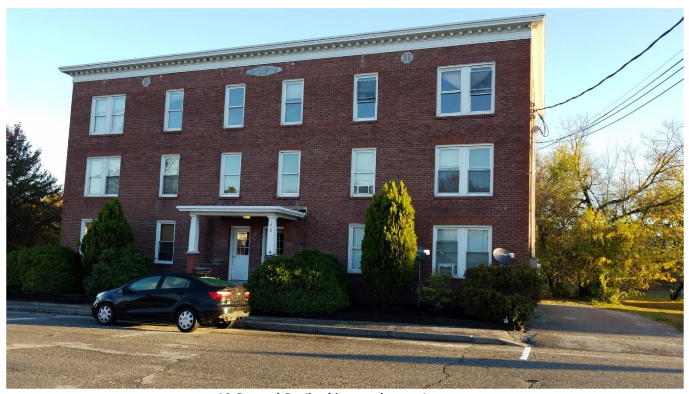
10 Second St. (looking to the east)