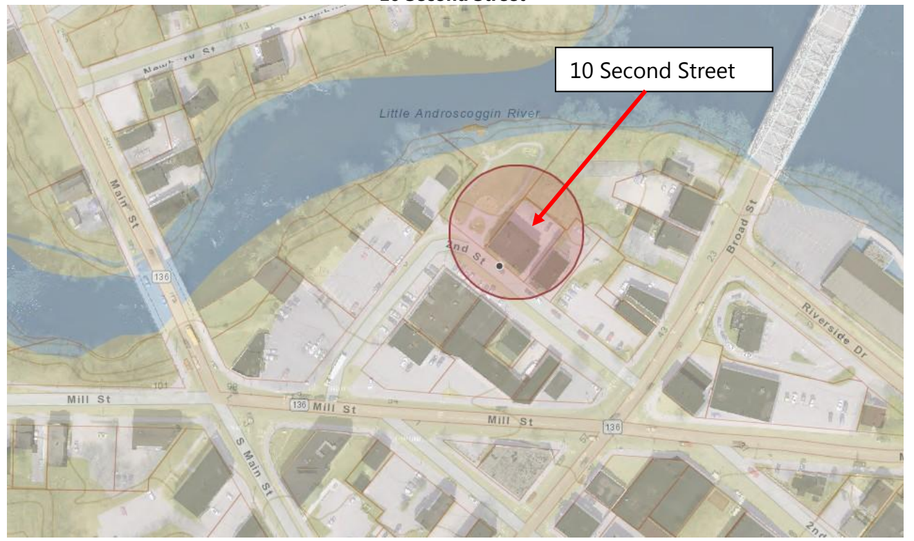
10 Second St. Vicinity Map