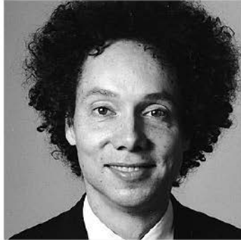
Malcolm Gladwell Award-Winning Journalist and Best-Selling Author