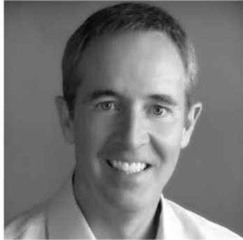
Andy Stanley Leadership Author and Communicator