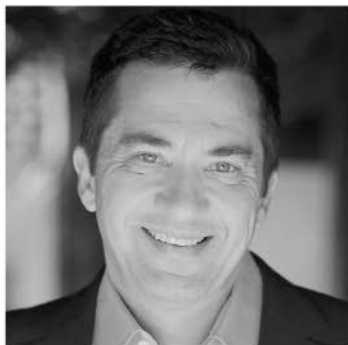
Dr. Henry Cloud Clinical Psychologist and Leadership Consultant