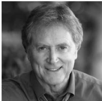
Randall Wallace Director, Screenwriter, Producer and Songwriter