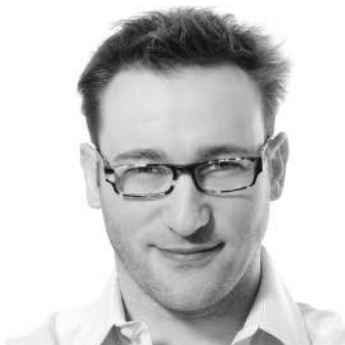
Simon Sinek Leadership Expert and Best-Selling Author