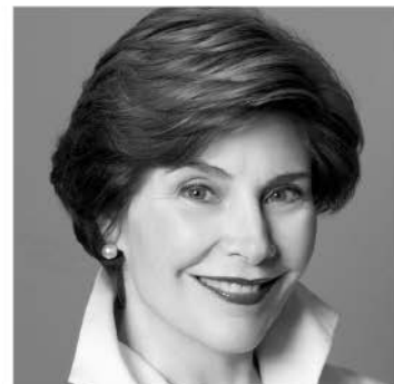
Laura Bush First Lady of the United States (2001-2009) via Exclusive Video Interview