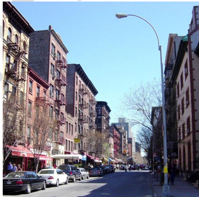
Examples of Downtown City Center- T- 5.2