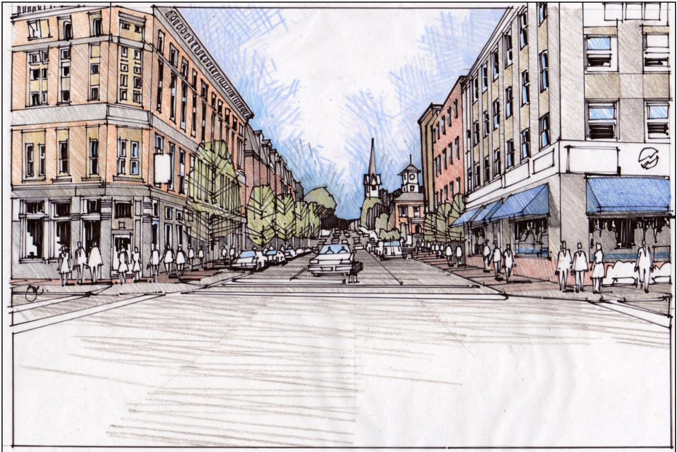
Illustrative View of T- 5.2 (Court Street)