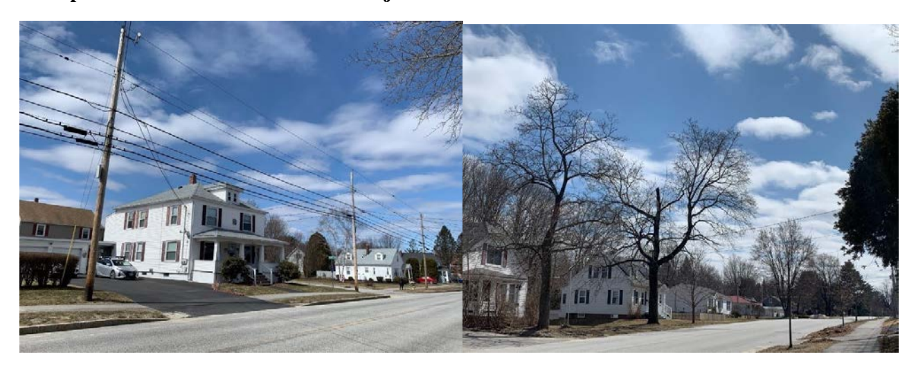
The 2021 Comprehensive Plan defined goals and priorities for the city to develop and improve its transportation network. Transportation objectives identified in the comprehensive plan should be considered as applied to Area A.