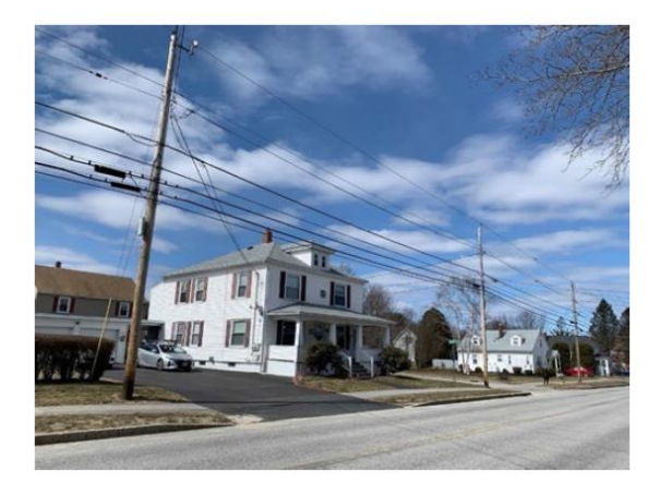
Intent and Purpose: Traditional Neighborhood (T-4.2B)

The Traditional Neighborhood district is characterized by small to medium sized buildings with smaller front yards and stoops in a more compact urban environment, and includes and traditional neighborhood sized storefronts. The smaller minimum and maximum building set-backs form a moderately dense street-wall pattern, diverse architectural styles and pedestrian friendly streets and sidewalks.