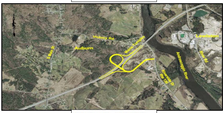
Strategy 2 – Exit "78"

Appendix E: Figure 3-1 Proposed Interchange Strategies: Page 3-3 of the 2010 Lewiston Auburn Downtown Connector Turnpike Interchange Study