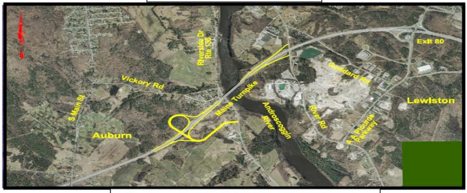
Strategy 5 - Exit "78" & 1/2 Exit "79"