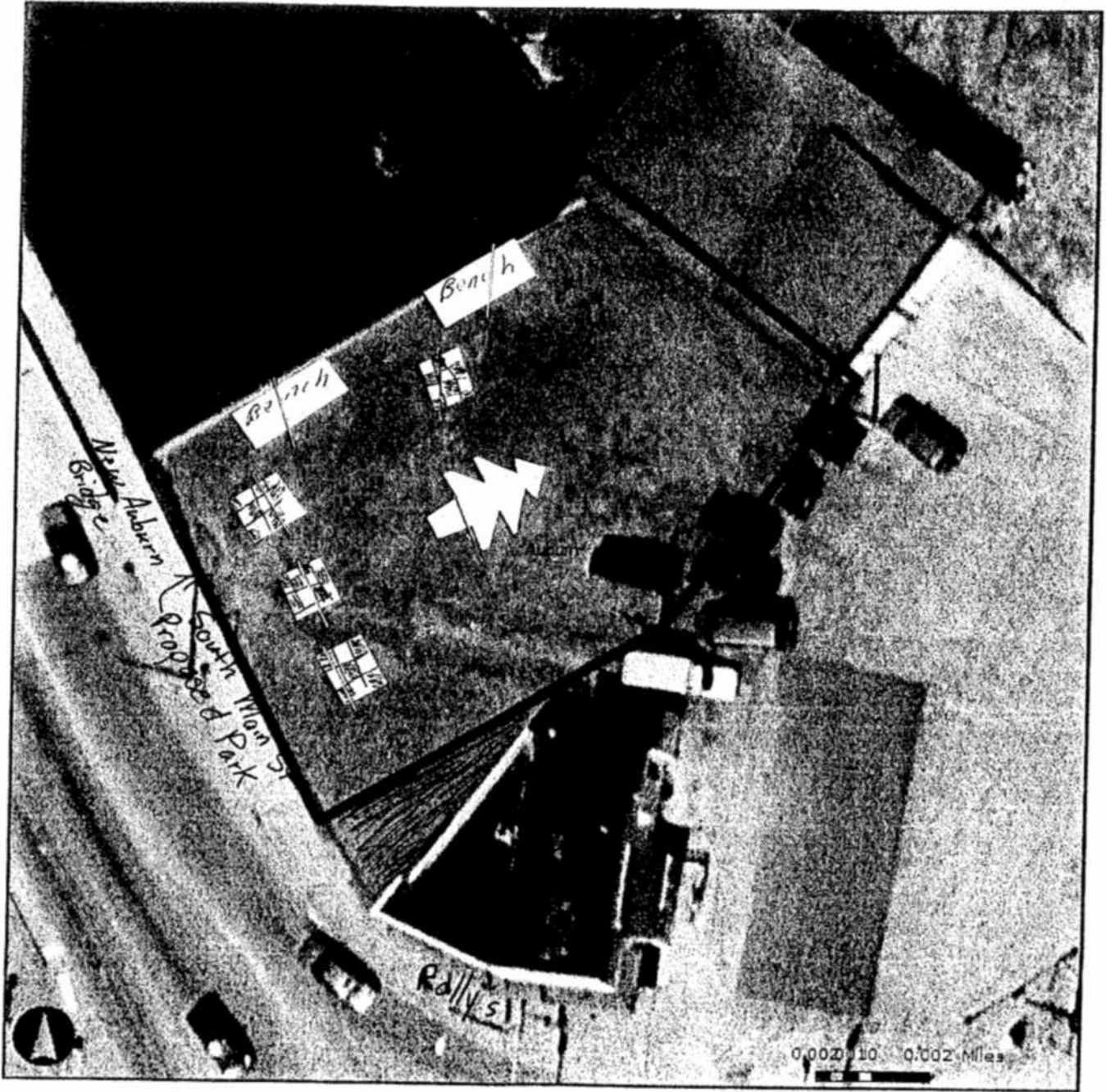
Proposed Sullivan Park beside Rolly's on South Main St.