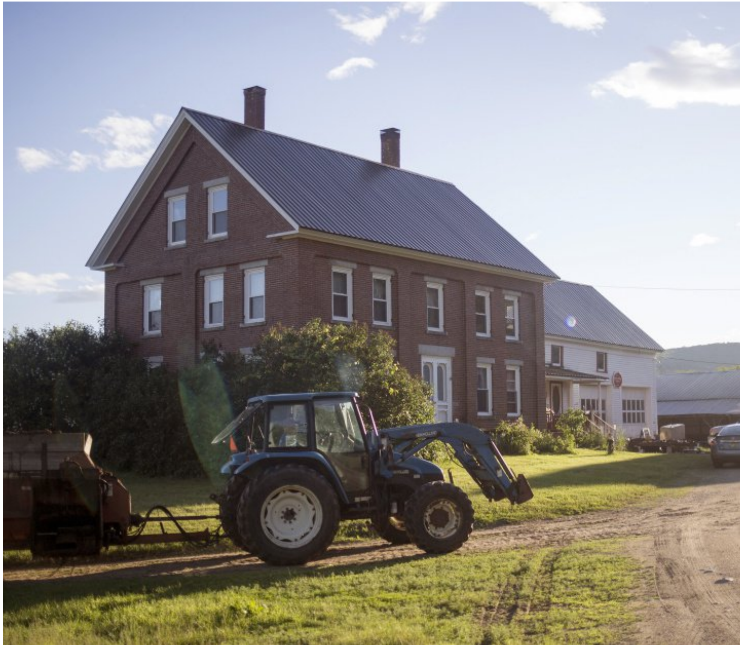
The River Valley Farm in Canton is a 300-acre operation that co-owner Carole Robbins' parents bought in 1944. Canton is one of the Maine communities that have food sovereignty ordinances allowing the sale of farm products unencumbered by state and federal licensing and inspection regulations.